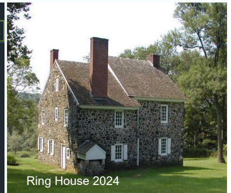
Ring House 2024

While we are hopeful that we can solve this mystery, we understand that not every mystery can be solved. The team on Oak Island may never find the treasure. But we should never stop seeking answers. In the process, we may find answers to other questions or even solve centuries-old mysteries such as what the Ring House looked like when Washington decided to make it his headquarters on the morning of September 9, 1777.