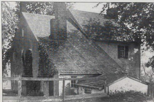
This rare photograph in the collection of the Sanderson Museum shows a rear view of Washington's Headquarters. Photo 7.88

One of the mysteries that has perplexed us is what the Ring House (Washington's Headquarters) looked like in 1777. We have one interior and several similar exterior photographs taken before the disastrous 1931 fire that left the house in ruin and a few taken during the early 1950s reconstruction. With such a small sample of documentary evidence and no archaeological evidence (no archaeology was ever conducted,) we have very little understanding of the home's construction and its interior configuration. Recently, students from West Chester University helped shed some light on this mystery while digging test pits for our proposed accessible pathways, which will connect the parking lots to the historic homes. One of the test pits dug near the rear of the Ring House revealed stacked stone, which suggested a possible building foundation. The team later confirmed the appearance of a foundation using ground penetrating radar. While this discovery was not entirely unexpected – we have an early 20 th century photograph of this part of the structure – we didn't realize that any part of it remained. This now presents the question of whether this was part of the original structure, and if so, what purpose did it serve.